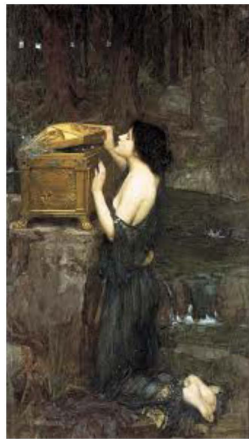
John William Waterhouse 1896

A brief summary of this story has to suffice here: