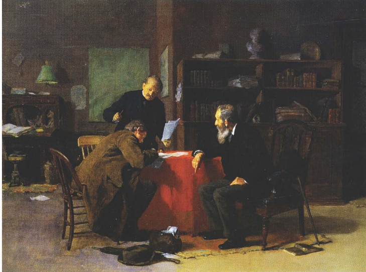
Louis C. Moeller

The handling of temptations and justifications why not to follow Advice Ethical Codes point to another problem: Most Ethical Codes lack referral to trusted institutions or persons to whom you can go for advice. Ethical decisions while demanded by society are regarded - at least in Western societies - as individual decisions with only very limited help before and after the decision. Advice and in particular institutional advice are a rare resource for those who have to decide.