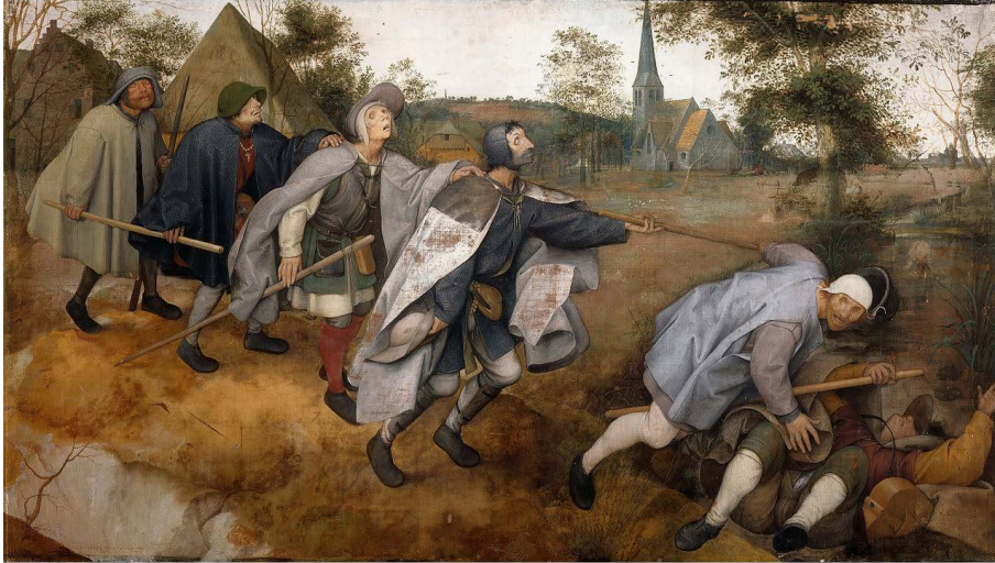
Pieter Bruegel the Elder

When we recall the difference initially made between Ethics as a set of rules demanding a kind of behavior including reflective behavior and /or as theories about such rules and when we refer to Morals as the way in which people actually follow or do not follow such rules then we have to restate again – and certainly so with regard to AI – that there is big output of Ethics but very little with regard to morals – i.e. empirical descriptions of how people in this business go about to make actual decisions and how they reason about them. Many norms, very little empirical material.