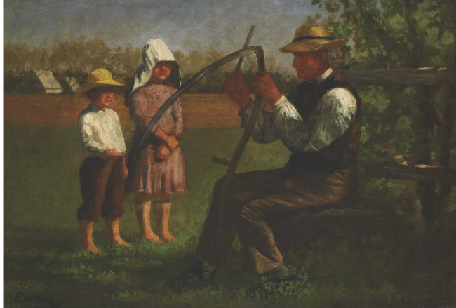
Enoch Wood Perry

Let us develop a toolbox to put Ethical Codes under more scrutiny and not to accept them at face value to make them more viable.